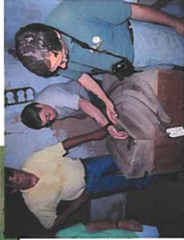
Name that object