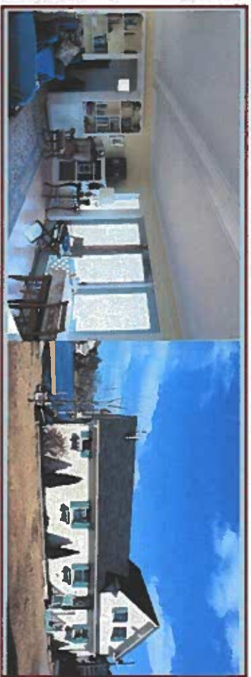
From the Tidewater web site; Lower left : Millstream Cottage