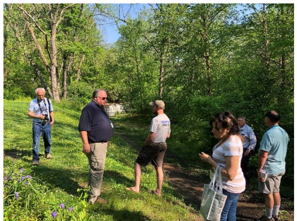
Members standing on the earthen dam with the stone dam in the background (and below) during the tour of the water system.