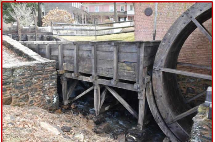
The flume at Union Mills prior to replacement.