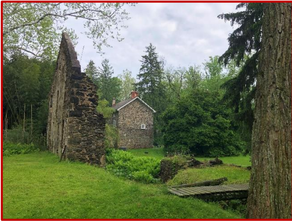
Facade of the Ivy Mills paper mill with the Clerk's House in the background.

In the evening we gathered at nearby Ivy Mills. In the same family since 1729, the mill produced the paper used in early currency. The homestead forms the Ivy Mills Historic District on the National Register of Historic Places and consists of the ruins of the mill, the clerk's house, the mansion, an ice house, root cellar, slave quarters recently recognized by descendants of the former occupants, and a repurposed barn used for special events. After a tour of the grounds and structures, we enjoyed a reception followed by a delicious barbecue dinner served in the barn.