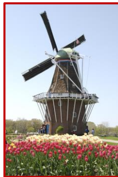
See the DeZwaan Windmill, Michigan, at the national SPOOM Meeting