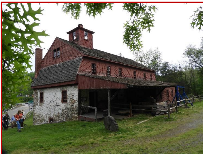
Newlin Grist Mill